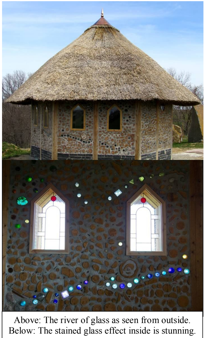
Above: The river of glass as seen from outside. Below: The stained glass effect inside is stunning.

Approaching the chapel, you notice the hexagonal shape and the beautiful dark stone stem wall. Your eyes take in the variety of cordwood rounds, splits, ram's horns and even some tiny cordwood we have dubbed "confetti". Wandering the perimeter you notice areas that look as if the wall is full of large bubbles. These are the external part of large concentrations of bottle-ends forming more colorful designs on the interior. Among other things, you can discern the flow of a glass river, an amethyst encrusted heart, the glow of a blazing fire, the whirling of wind, the iridescent blue wings of a dragon fly and even the boot of a small child who is said to be climbing the tree in the south corner. As you stand before the archway of the double doors you see they are flanked by fist-sized stones on each side. Above them a sunburst made of thin cordwood wedges draws your eye upward. You realize the roof is made of thousands upon thousands of reeds that have been thatched evenly and steeply. The peak is crowned with a copper roof cap and spire directing your eyes ever upward to the heavens. The ash doors are solid and heavy, hand-wrought by a Wisconsin Amish door maker. They hang on four heavy-duty hinges; the distinctive doorknobs beckon your hands to open them and enter.