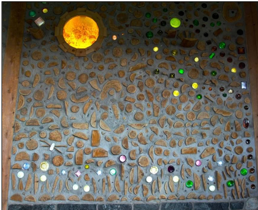
The “Sunrise Wall” with Brother Sun & Sister Mother Earth.

As you enter, to your left is wall #1, the “Sunrise Wall”. This wall showcases our Sister Mother Earth. Here you meet Brother Sun, a stained glass window framed with stout cedar rays. The golden, textured glass pulsates with the burning light of the real sun shining through it. Below is a meadow alive with flowers and a dragonfly. The grasses are narrow log-ends called slabs, the