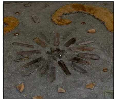
The Eternal Flame

Continuing with the doorway explanation, there is a blue beyond us like the sky or “the wild blue yonder”. Beyond that we are enveloped in a warm white light. This is often spoken of when people have near-death experiences. We do not know what is beyond the white light. I placed the quartz mandala there – a highly energetic thing – to represent the Eternal Flame, the Source, Love, or however you may think of God. I am a firm believer in God; that there is something