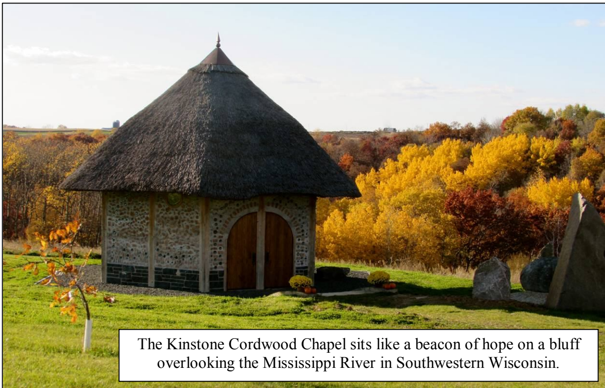
The Kinstone Cordwood Chapel sits like a beacon of hope on a bluff overlooking the Mississippi River in Southwestern Wisconsin.

Have you ever been out driving or cycling in the countryside and stumbled upon an unexpectedly delightful scene? This may happen to any who venture around the farm country on the river bluffs of Buffalo County, Wisconsin. When driving up Cole Bluff Lane you suddenly find yourself in what seems to be another world. A world with huge megaliths in circular or linear patterns, a pond with tall stones sticking out of the water, a curvaceous, dry-stack stone sculpture with contours mimicking the flow of the surrounding bluffs, a fantastic thatched building with a spire pointing heavenward and more, everywhere you look. All of this is nestled in a place of supreme natural beauty with lush fields, woodlands, gardens and scenic views sweeping down valleys to the Mississippi River that seems just a stone's-throw away. You have found Kinstone.