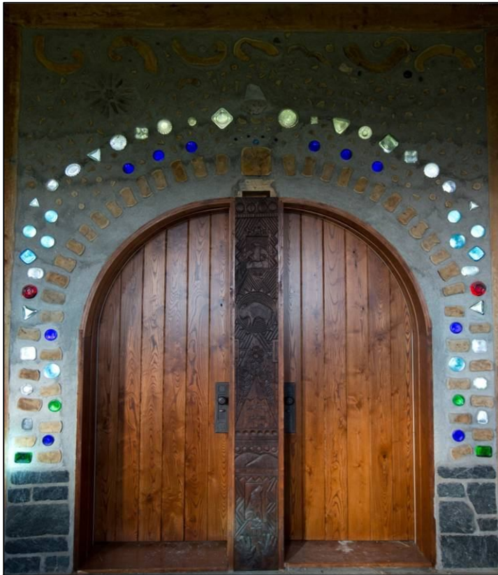
The arched doors of Kinstone Chapel.

On either side of the doors there is a column of bottle-ends of various colors, ending in a red one on each side. These are two of just four red glass pieces in the chapel. These are Depression Era red dessert bowls that were cracked and given to me by my brother-in-law. Just above the red bottle-ends on each side are three aqua bottle-ends made from old mason jars. Above the cordwood arch is an arch of blue bottles and above that is an arch of clear bottles. At the apex of the clear arch there are two pieces of quartz crystal that form what looks like a sailboat floating on three small cordwood pieces shaped like waves. To the left is a mandala made of 19 clear quartz points surrounding 9 quartz points. To the right is a doorknob taken over 40 years ago from the house I grew up in, before it was demolished. Above all of this is a row of wooden “ram’s horns;” these may depict wind, but one of my kin fittingly suggested that they are fetus shapes; a true symbol of new life and transformation. The thinnest ram’s horn is a piece of chestnut cut from my father’s favorite chestnut tree that died shortly after he did in 1994.