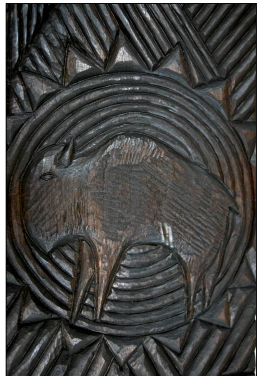
The Sacred Buffalo

Finally you turn and study the doorway with its stunning arches of wood and light. This wall #6, the “Doorway”, was the final wall we worked on. The doors themselves make this an impressive wall, but so much symbolism is embedded around the doors that it saturates the soul. This wall was the most difficult to design; the final element of the poem that still had to be incorporated was Sister Bodily Death. How does one design a representation of death? For me, I understand death to be just a doorway into another existence that we cannot comprehend while here on earth. So, the entire wall is a symbolization of this transition. The arched doors are framed by a series of corresponding arches. First an arch of rectangular cordwood pieces, each one specifically cut to this shape. Between the doors is a fabulous carving featuring local Native American motifs, specifically the Dakota Sioux, who hunted this land before my family arrived here four generations ago. The central motif is a buffalo, sacred to the native people. It is particularly auspicious for us as Kinstone sits on Buffalo Ridge in Buffalo Township in Buffalo County , Wisconsin! There’s that three again!