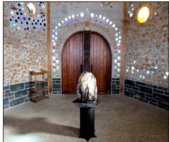
The Flame is the centerpiece.

Last, but not least, we stop to ponder the centerpiece of the chapel, a gorgeous piece of petrified wood mounted on a custom black metal pedestal. This piece, called The Flame, looks like it is on fire, especially when the sun shines in and casts light and colors from the bottle-ends onto it. This was a gift from my good friend, Bill Cohea, of Columille. He visited Kinstone in 2012 and felt that the center of the chapel would need a good strong stone. Later he sent The Flame via special courier (a friend driving this way) just for this purpose. Its graceful shape and caramel-black color are so alive. It enhances the whole experience.