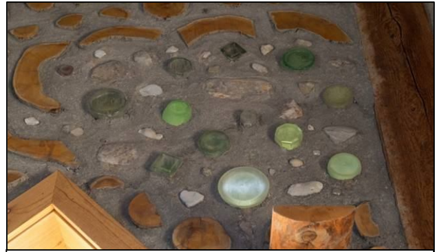
A cloud of stone, glass and wood.

As you move around to walls #2 & #3 you find Sister Water and Brother Wind. The waterway starts with a pile of river rocks incorporated right into the wall. It gently wends its way, below the windows, in an ever-increasing slope across the two walls. Above this blue and green (and purple) river, playing above and around the windows, you see many curving lines of clear and light colored bottle-ends illustrating breezes and wind. Special pieces of cordwood represent a bird, the bluffs along the river, and a wave. A cloud of white quartz stones and milky bottle-ends is defined by a series of curved “ram’s horn” cordwood log-ends, giving it a realistic cloud-like appearance. At sunset during certain seasons the wind and cloud in wall #3 glow softly orange. Amazing!