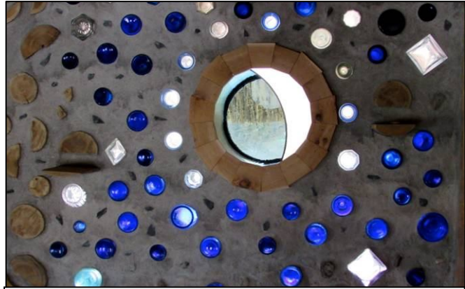
Radiant Sister Moon

beyond us, to the way hurricanes form and the way water drains, fern fronds, shells and even in our own DNA strands we find the ubiquitous spiral! Add some movement to a spiral and, "voilà!" we have a vortex, the greatest energy generator of them all. Below the shell is my favorite constellation, Pleiades; it is only discernible with a generous amount of imagination so don't be upset if you don't readily see it. Here you may notice several cordwood pieces sticking out from the wall. These are ready-made shelves. There are three in the Night Wall, three in the Sunrise Wall and two more above the river in wall #3. Since no candles are allowed in the chapel due to the flammable nature of the thatch, what will go on these shelves? You may guess statues, flowers or figurines; but no, my answer is simple and obvious - it will be stones!