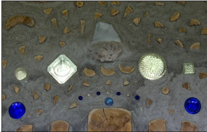
A sailboat crests the arch of white light, floating on three cordwood waves in a sea of blue and gray.

much greater than us that has created us and cares for us. We might think of ourselves on a journey, perhaps to return to God; this is signified by the crystal sailboat. We may think we have no say in our fate as our boats are tossed about by the waves and winds; but in reality, we each have some measure of control as we decide to ease or trim the sails, tack or jibe, change directions, or make adjustments to set a course for ourselves. The chestnut piece is a sea bird, a